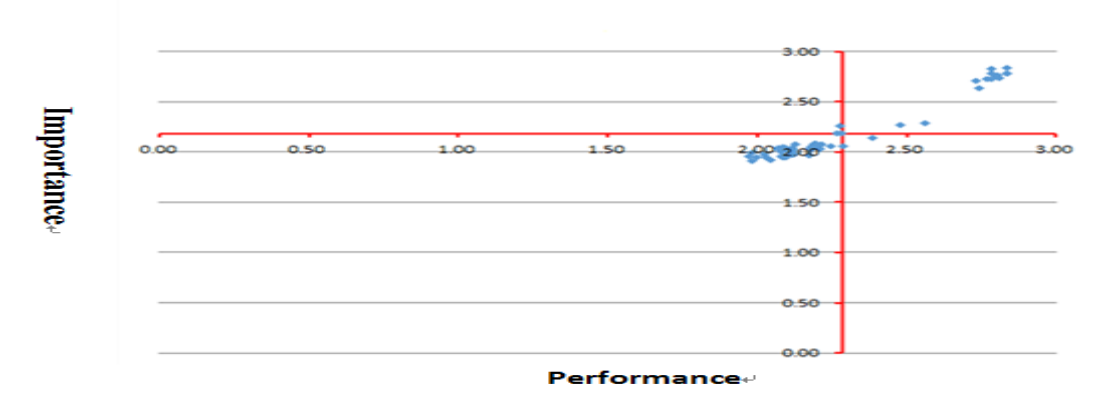
FIGURE 3 ATTRIBUTES POSITIONING IN THE IPA QUADRANT