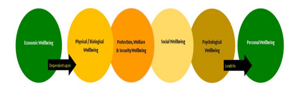
FIGURE 1 FACTOR DETERMINING QUALITY OF LIFE AND WELLBEING

future, they will act opportunistically. Therefore, it is the responsibility of the state. (De Silva et al., 2021)Though, Pakistan which ranks 171 among 200 countries in GDP, PPP per person; according to (Ciafactbook, 2020); its government may not be able to provide an answer. Zehra & Usmani (2021) argued that family entrepreneurship can keep the families integrated and move towards prosperity. On the other hand, Zhu et al. (2019) while comparing the women entrepreneurship transitional economies suggested that families when working together in micro and small entrepreneurial ventures can bring self-sustainability to communities (Ingalagi et al., 2021).