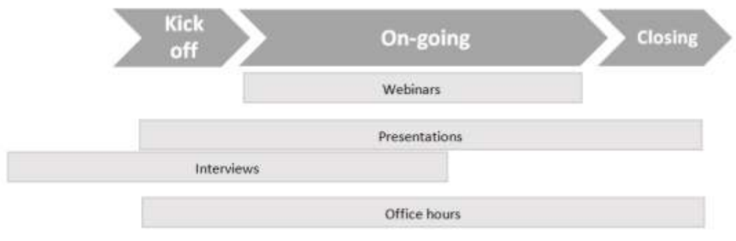
FIGURE 2 NoBI PROGRAM ACTIVITIES

Classes are either face-to-face or virtual and cover the following topics: 1) business model canvas; 2) customer discovery; 3) best practices for conducting interviews; and 4) customers, buyers and ecosystem.