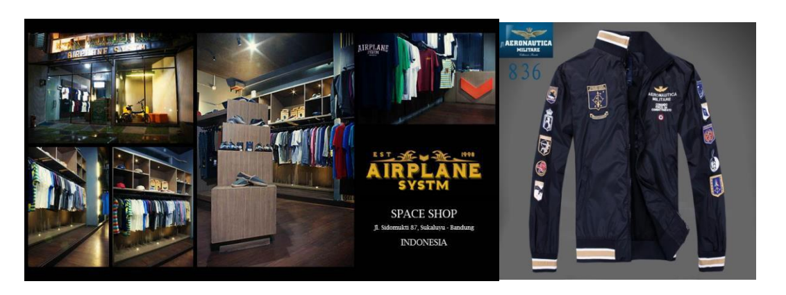
Figure 7 PRODUCT "APL"