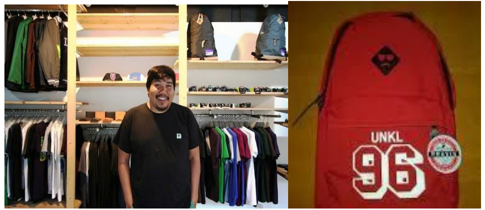
Figure 5 PRODUCT "347"