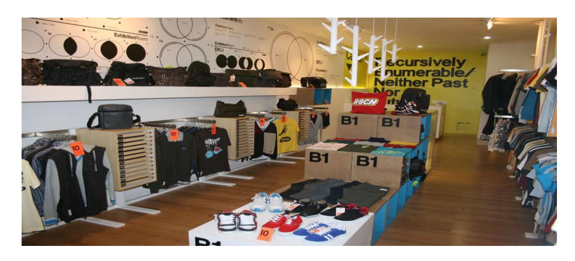
Figure 4 PRODUCT "OR"