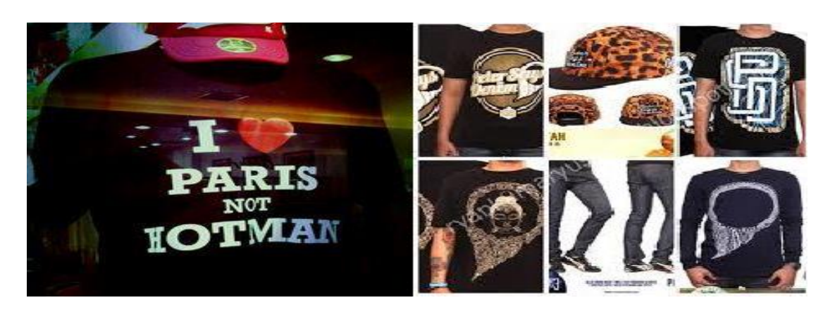
Figure 6 PRODUCT "RCT"