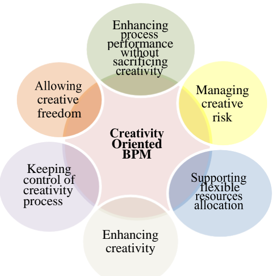
Figure 1 BPM FACETS OF CREATIVITY ORIENTATION

Business processes that involve creativity differ from conventional business processes in many respects: they have a low level of repeatability, typically are high value-add processes and knowledge-intensive involve creative persons, have a high demand for flexibility and are characterized by particular (creative) risks. The aim of their study is to "manage creativity without sacrificing creativity." Seidel et. al. summarize different facets under the term creativity-oriented business process model (BPM). Figure 1 provides an overview about the key requirements of such processes.