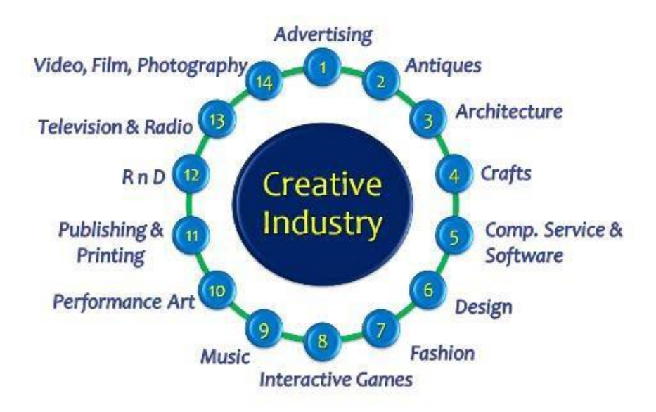
Figure 2 CREATIVE INDUSTRY SECTORS IN INDONESIA

Bandung, a creative city with the greatest creative potential of human resources, is the largest city of creative industry in Indonesia, especially for distro, culinary, textile, and other creative products. Distro, stands for distribution stores or distribution outlets, is a shop, which sells clothes and accessories, or even produces them. Distro is generally small and medium clothes industries, which independently owned and developed by among young people. The products produced by distro sought to be produced in big volume, in order to maintain the nature and the exclusiveness of the products and handicrafts.