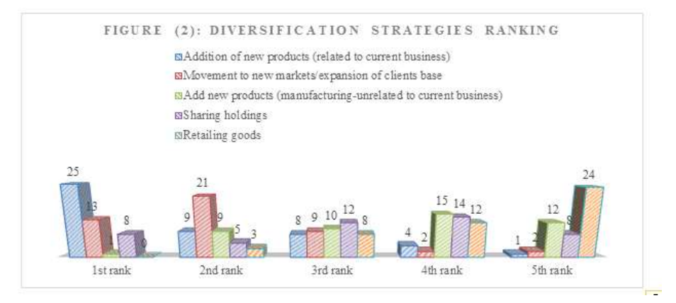
FIGURE 2 DIVERSIFICATION STRATEGIES RANKING