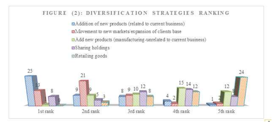
FIGURE 2 DIVERSIFICATION STRATEGIES RANKING