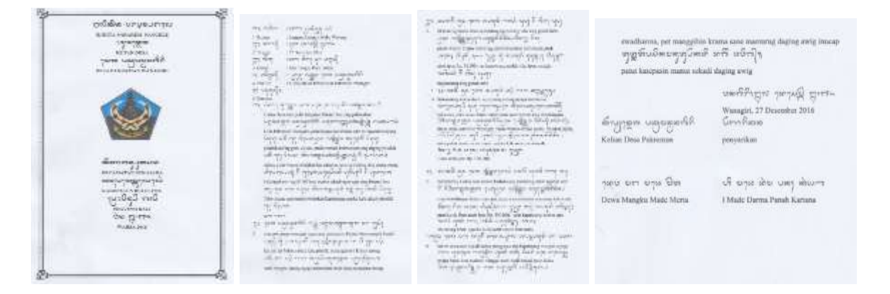
FIGURE 2 EXCERPT OF AWIG-AWIG (CUSTOMARY LAW) WANAGIRI CUSTOMARY VILLAGE ON FOREST

The initial assumption is that if we refer to the issuance of the permit, the orientation of the Village Forest Policy (HPHD) in Wanagiri Village is only rigidly oriented towards the Official Village without any orientation influence on the Wanagiri Indigenous Village. Therefore this research discusses more deeply about the orientation that is aimed at the current Village Forest policy as well as the policy orientation needed by HPHD in the future so that it can be synergized with local wisdom and support forest conservation in a sustainable manner (Soekanto, 1979).