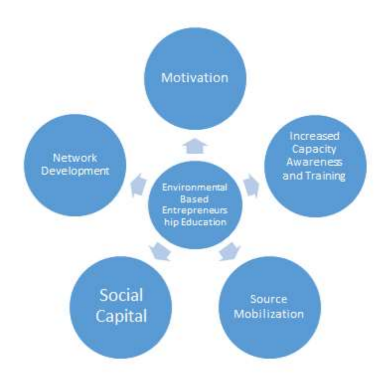
FIGURE 2 AN ENVIRONMENT-BASED ENTREPRENEURSHIP EDUCATION MODEL IN THE VILLAGE OF MARGALAKSANA CIPEUNDEY, INDONESIA

ins and outs of entrepreneurship (Figure 2 (Source: (Sumodiningrat, 2009) modification by the author)).