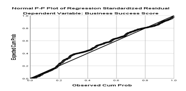
FIGURE 2 NORMALITY PLOT

In checking for non-violation of the classical regression assumptions, we checked for outliers, Normality, Linearity, Homoscedasticity and Independence of Residuals. One of the ways that these assumptions can be checked is by inspecting the residuals scatterplot and the Normal Probability Plot of the regression standardised residuals. Our Normal Probability Plot points lie in a reasonably straight diagonal line from bottom left to top right. This suggests no major deviations from normality. In the Scatterplot of the standardised residuals (the second plot displayed) our residuals are roughly