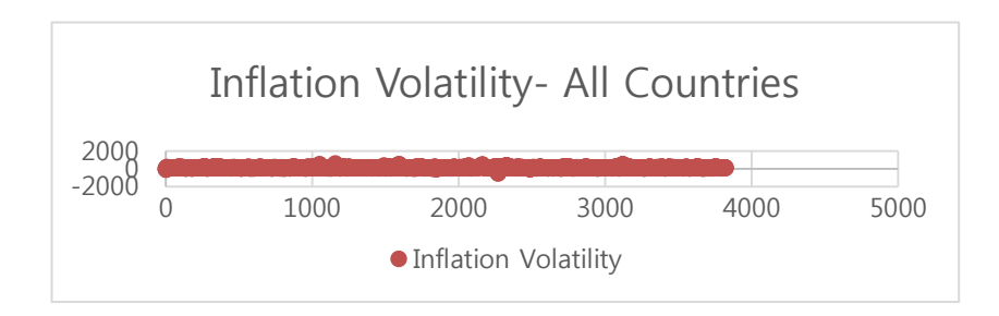
Figure 1 INFLATION VOLATILITY- ALL COUNTRIES

Considering all the above discussion, the objective of the paper is to find the impact of quality of institutions and openness on inflation volatility. This is one of the primary studies which addresses the relationship of quality of institutions, openness, and inflation volatility. Furthermore, the paper identifies the desired relationship between inflation volatility and the quality of institutions of OECD countries. In the early 1980s, the inflation of OECD has been a decline to 2% from 10% over the decade 1995-2005. This progress has coincided with an increase in globalization, with more goods and services produced and traded between non-OECD and OECD countries increasing the share of GDP of OECD (Pain et al. 2008). But after the financial crisis, the targeted inflation is overestimated and needs to be investigated.