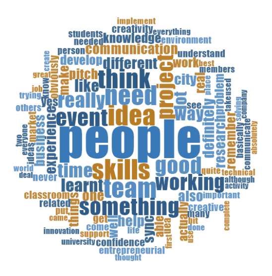
FIGURE 3 ALL EXPERIMENTATION RELATED QUESTIONS' WORD CLOUD