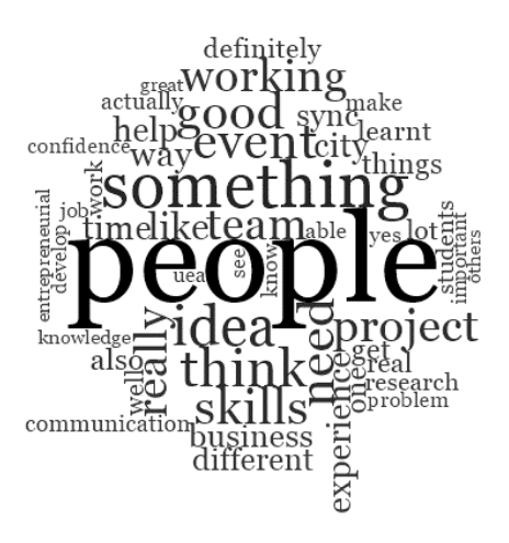
FIGURE 4 ANSWERS ON PRACTICE ON REFECTION'S WORD CLOUD