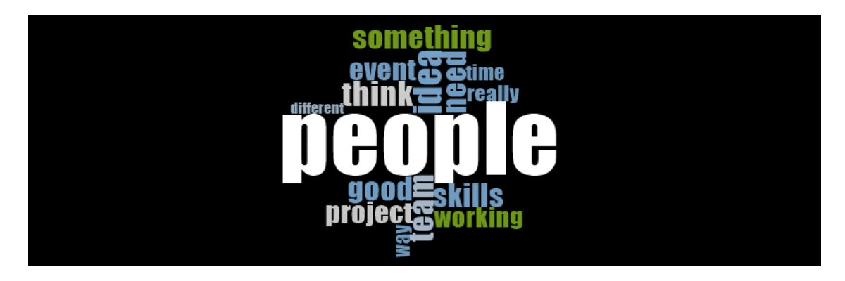
FIGURE 2 WORD CLOUD RELATED TO EMPATHY ANSWERS