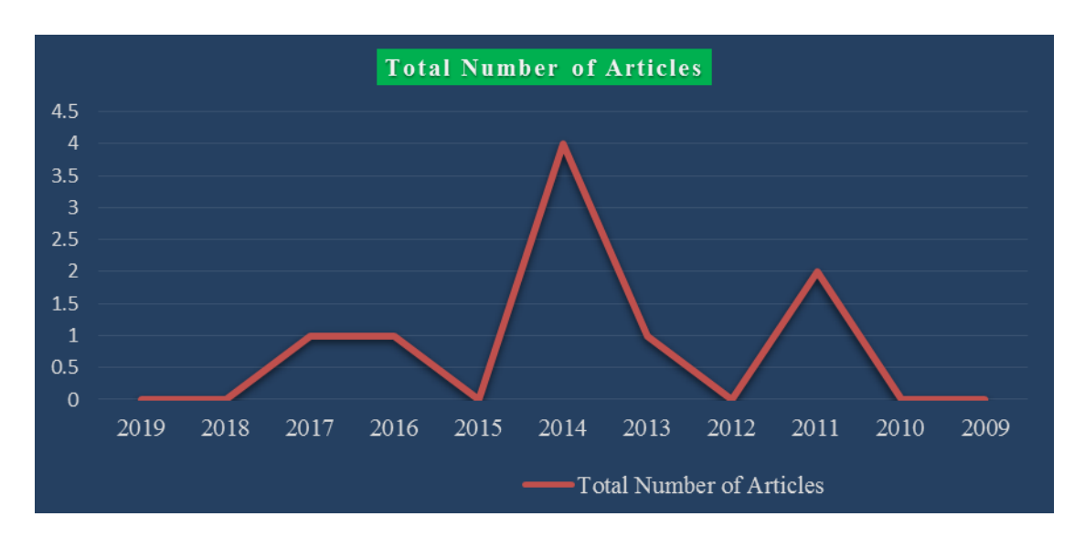
Figure 2 TRENDS IN PROJECT RISK