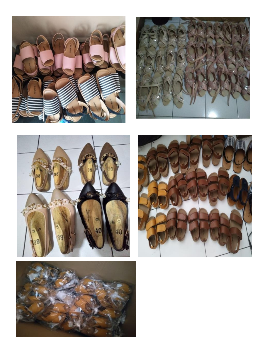
FIGURE 1 VENYBROSE PRODUCTS AND MAKLON RESULTS FROM RESELLERS

From the results of direct interviews with the owners of Venybrose Shoes, the business development carried out is creative and innovative. Venybrose not only utilizes technology but Venybrose strives to develop continuously by creating models of shoes and sandals that attract customers because the shoes and sandals that are made follow the trend in now. Venybrose Shoes is not only involved in sandals and adult shoes, but also develops models for children called Venybrosekids with small sizes. Venybrose develops its business by continuing to maintain open resellers by giving permission to use its own brand name or called maklon, one of which is the KenKei brand. The Kenkei brand sells shoes and sandals with one pair of children and mothers, which makes consumers interested because they can use the same product and there are other brands that Venybrose produces, not only Kenkei but there are more, namely Dimy.shoes, Osborn, and SieAzizah Shoes, Rainbows.