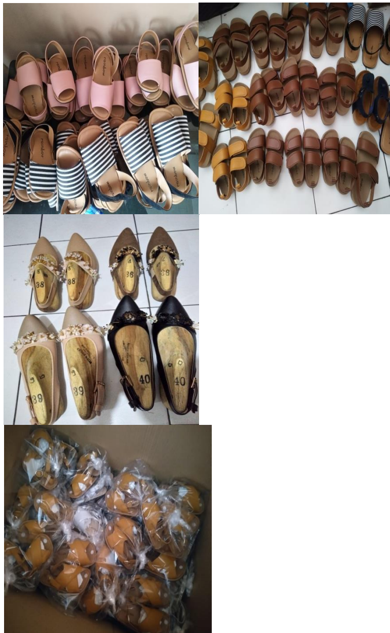
FIGURE 1 VENYBROSE PRODUCTS AND MAKLON RESULTS FROM RESELLERS

In Figure 1 this is an unpackaged product which will be packaged by customers from other brands, including Kenkei, Ranbow, Dimy Shoes and the owner's own account, Venybrose Shoes and Venybrosekids. These products will be packaged individually by brand owners who are very creative and innovative which were previously unattractive but after being marketed