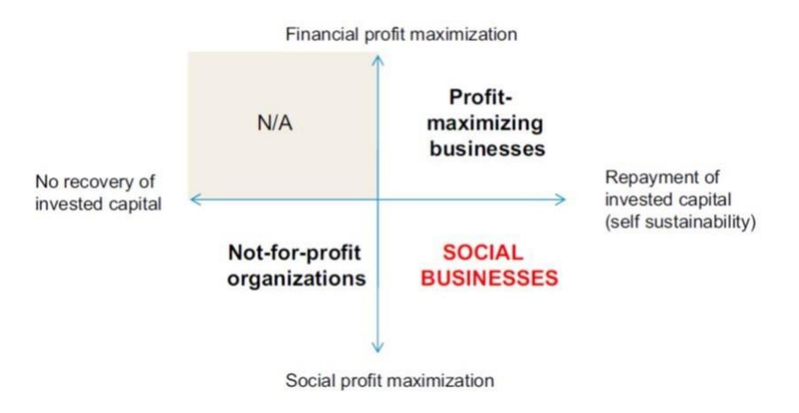
Figure 1 CONTRIBUTION OF SOCIAL BUSINESS (YUNUS, MOINGEON, & LAURENCELEHMANN-ORTEGA, BUILDING SOCIAL BUSINESS MODELS: LESSONS FROM THE GRAMEEN EXPERIENCE, 2010)

A social business is driven by social objectives, with the prime purpose of solving social problems where profit is one of the main objectives. In other words, a non-loss, non-dividend organization committed to addressing social issues is a social business. The company should concurrently be owned by an entrepreneur who reinvests all profits to grow and develop it. (Yunus & Weber, Building Social Business: The New Kind of Capitalism That Serves Humanity's Most Pressing Needs, 2010) in Figure 1.