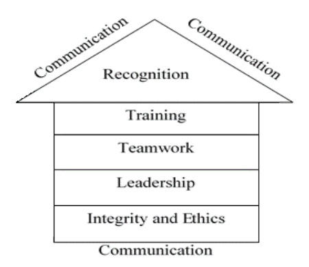
FIGURE 1 THE TQM STRUCTURE

This model has been used in the computation of TQM indices used in the present analysis. For the purpose of the study, only the first three components of TQM (integrity, ethics, and trust) are included in the model.