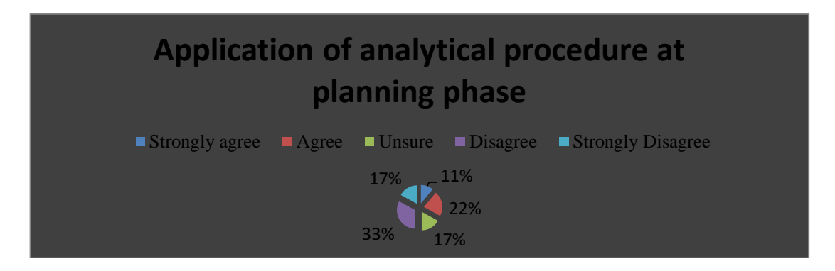
FIGURE 1 THE NEED FOR APPLICATION OF ANALYTICAL PROCEDURES

From the data tabulated 83% that is (50%+33%) of the respondents agreed that they apply analytics at the planning stage of the audit process, this can be presented as follows: