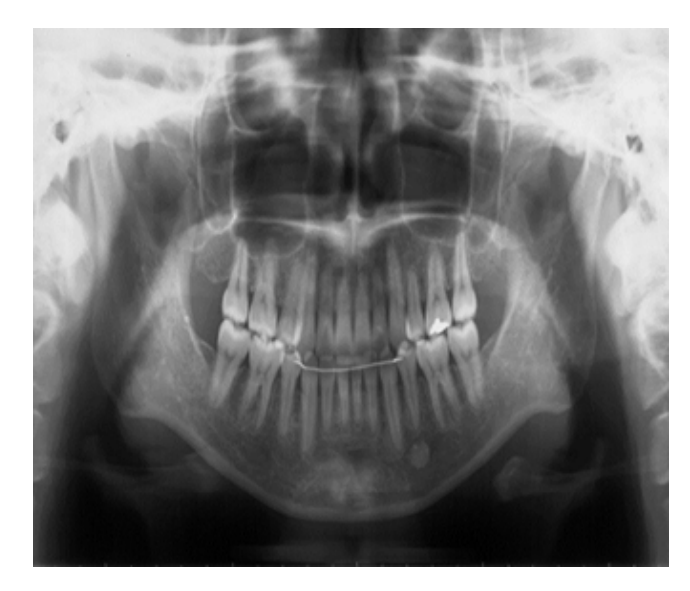
Figure 4. Pre-treatment panoramic radiograph.