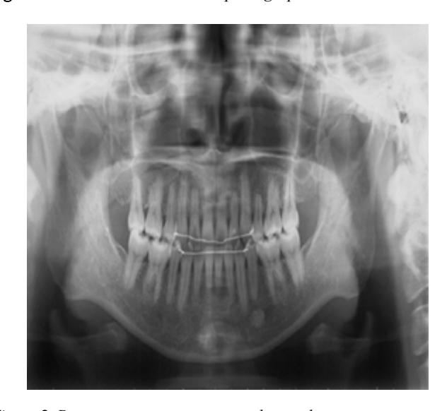
Figure 8. Post-treatment panoramic radiograph.