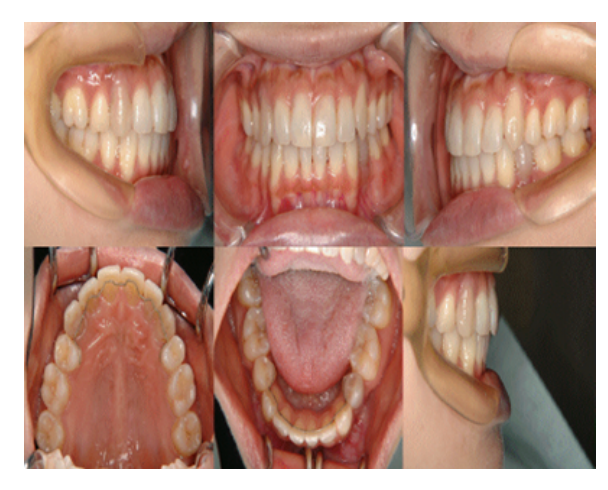
Figure 7. Post-treatment intraoral photographs.

decreased gradually and completely stopped after 1 year. She did not have a pain without any medication during these 5 years.