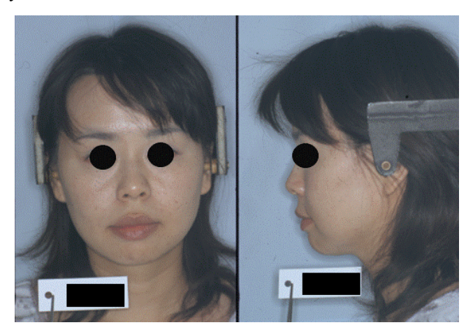
Figure 1. Pre-treatment facial photographs.

treatment, and chronic pain associated with PD was relieved by TCA administration.