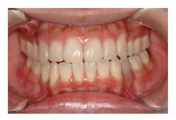
Figure 3. Pre-treatment intraoral photographs (centric relation).

The both right and left molar relationship was class I, and the teeth were well aligned in either arch. But the lower midline was shifted to the right direction by 2 mm in centric occlusion caused by initial occlusal contact at second molars (Figure 2), although the midline coincided in centric relation (Figure 3). A panoramic radiograph showed no abnormal observation (Figure 4). As shown in the cephalometric measurements, a skeletal Class 1 relationship (ANB angle, 4.2°) with short face type (FMA, 26.3°) was evident. Based on this information, the patient was diagnosed to have a mandibular deviation to the right side with initial occlusal contact at second molars.