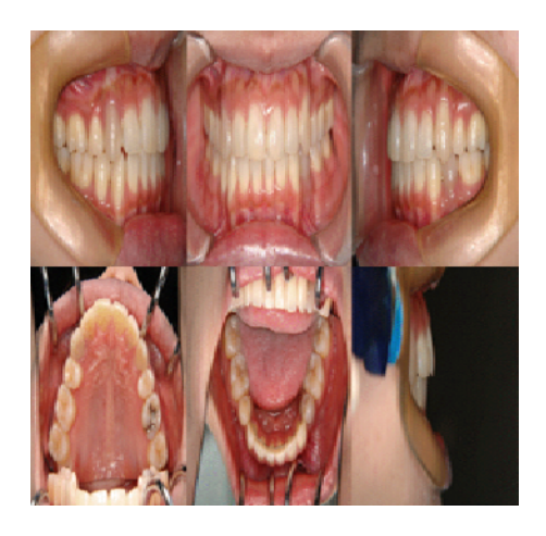
\textbf{\textit{Figure 2.}} \ \textit{Pre-treatment intraoral photographs (centric occlusion)}.

The patient, a female aged 33 years and 6 month, had previously received an orthodontic treatment by other orthodontist with all first premolars extraction. However, she complained of impaired molar masticatory function and suffered toothache in upper molars from half way of the first orthodontic treatment. The pre-treatment facial photographs showed a straight profile (Figure 1). The intraoral photographs and dental casts revealed a 2.0 mm over jet and a 2.0 mm over bite.