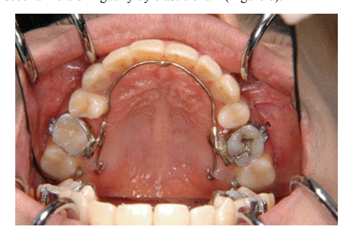
Figure 6. Lingual crown inclination of upper second molar by lingual arch.

The lingual arch was placed on the upper first molars. The lingual button was set on the second molars and we moved the second molars lingually by elastic chain (Figure 6).