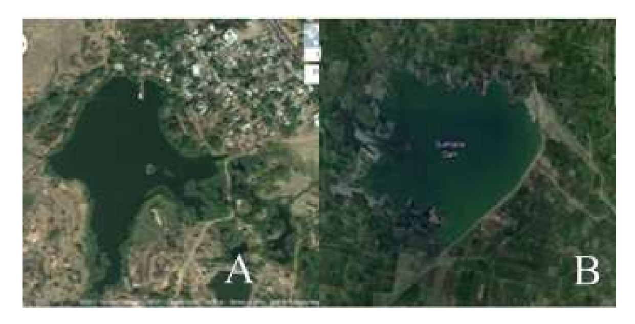
Figure 1. Satellite view of Kagzipura reservoir (A) and Sukhana reservoir (B).