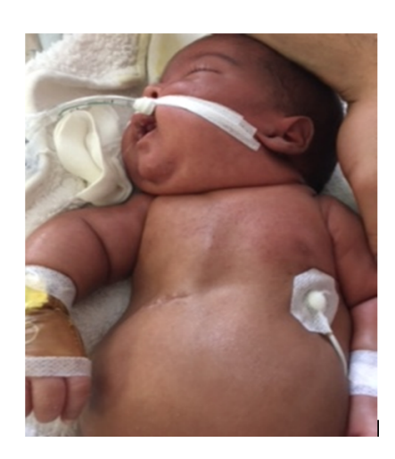
Figure 1. Clinical appearance of narrow thorax and large and splayed abdomen.

The male neonate was delivered by caesarean section at 38<sup>th</sup> gestational week to a 27 year old mother. He weighed 2220 g (<10 p), his length was 51 cm (75-90 p) and head circumference was 37 cm (>90 p). Apgar scores were 4 and 7 at 1<sup>st</sup> and 5<sup>th</sup> minute, respectively. He was intubated because of respiratory distress in delivery room and admitted to neonatal intensive care unit. On physical examination, he had intercostal retractions with narrow thorax cavity, an enlarged and splayed abdomen, bilateral cryptorchidism and 4.0 \times 6.0 cm sized lumbosacral meningomyelocele as shown in Figure 1. There was a very thin layer on the defect. In lower extremities there was no voluntary motion and deep tendon reflexes were absent. Prenatal ultrasonography was detected oligohydramnios, lumbosacral meningomyelocele and hydrocephaly. Family history was unremarkable and no paternal consanguinity. Posteroanterior X ray graphy revealed hemi vertebra on 3<sup>rd</sup> lumbar vertebra and vertebral fusion defects as shown in Figure 2.