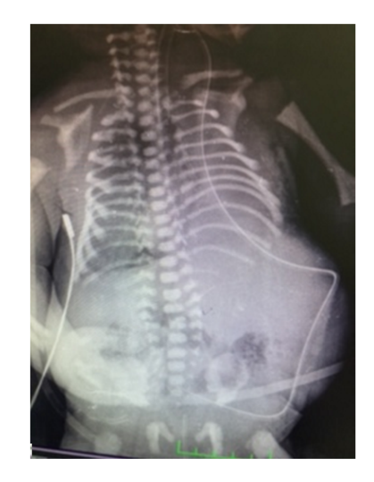
Figure 2. Chest radiograph shows vertebral anomalies and ventriculoperitoneal shunt catheter.