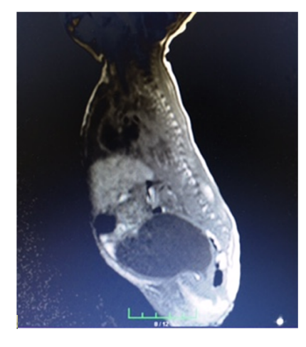
Figure 3. Spinal MRI image shows post operative changes in lumbosacral region, enlargement of the bladder and also lack of abdominal wall muscles.

Echocardiography showed 4 mm secundum atrial septal defect and pulmonary hypertension with 47-52 mmHg pulmonary artery pressure, an intact interventricular septum, no persistent ductus arteriosus. Cerebral and spinal magnetic resonance images revealed Chiari type 2 malformation, hydrocephaly, and postoperative changes in lumbosacral region, enlargement of the bladder and also lack of abdominal wall muscles as shown in Figures 3 and 4.