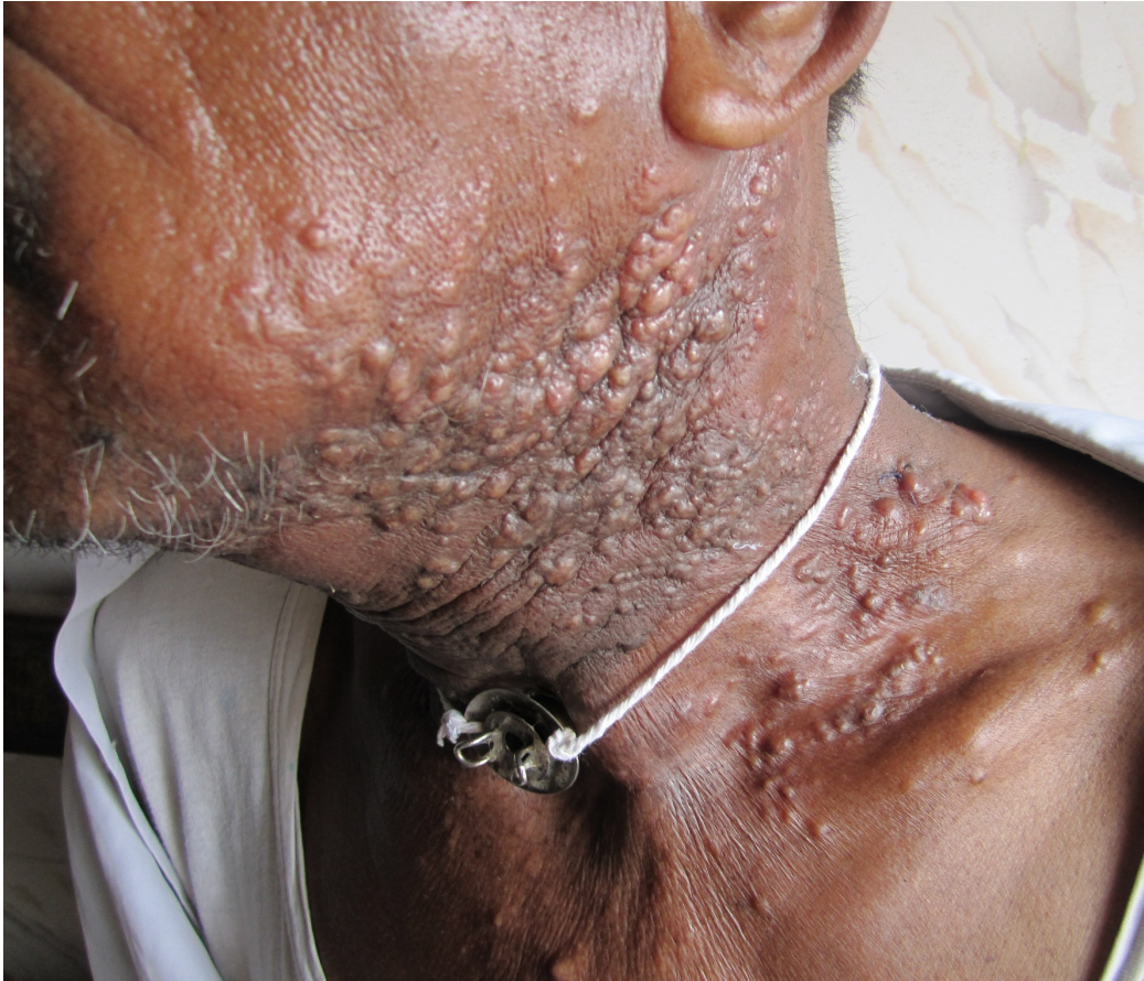
Figure 1: Asymptomatic grouped papules and nodules coalescing to form plaques over the left side of the neck