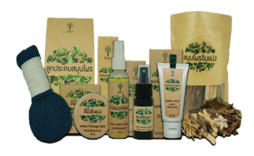
FIGURE 5 THAO EN ON HERBAL PRODUCTS THAT MEET THE STANDARDS

For publicity by issuing brochures and promotional posters according to the product list, along with specifying qualifications and standard certification numbers, to build consumer confidence, assign a QR Code for easier access to purchase channels, along with Create advertising media that reach the modern consumer and produce video media, presenting Inpang products to social media channels. www.Inpangherb.com and Page Face book Inpang herb.