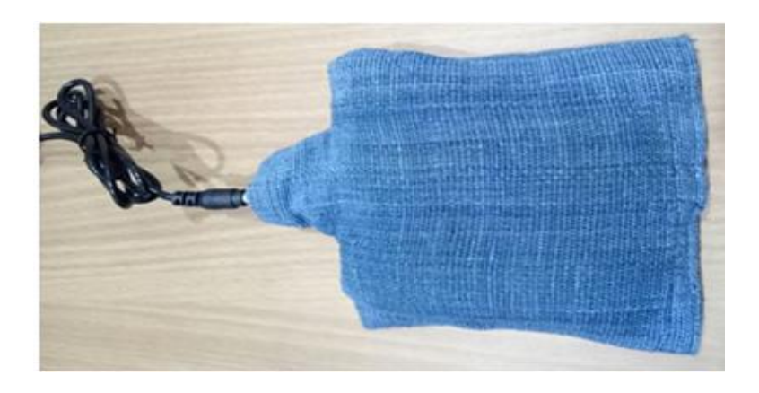
FIGURE 4 THE HEAT PACK INNOVATION