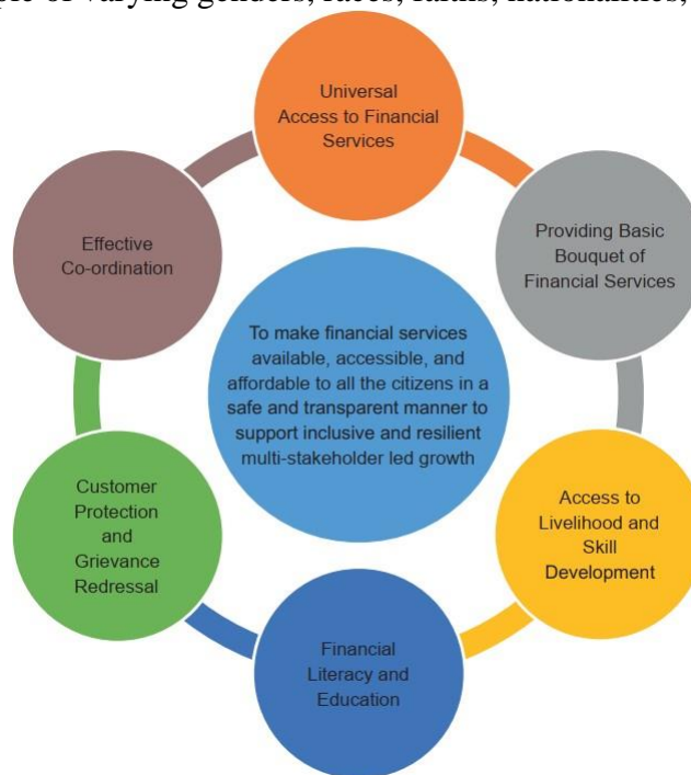
FIGURE 2 VISION OF NATIONAL STRATEGY FOR FINANCIAL INCLUSION

The term "social sustainability" refers to societies that are both diverse and stable, in which individuals are given a voice and governments take action. Increasing the possibilities for everyone today and in the future is also a component of "social sustainability". It is necessary for the elimination of poverty, shared prosperity, and economic and environmental sustainability. The work of Social Sustainability and Inclusion is centered on assisting people of varying genders, races, faiths, nationalities,