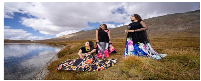
FIGURE 5 FUTURE OUTLOOK

Moving forward, Lulusar aims to continue innovating sustainable fashion practices, exploring new eco-friendly materials, and expanding their global presence. They plan to invest in technology for sustainable manufacturing and further strengthen their brand identity as pioneers in ethical fashion (Figure 5).