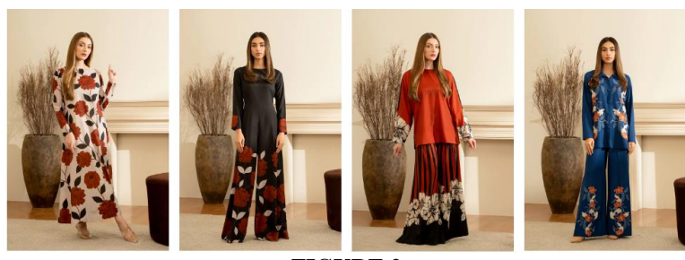
FIGURE 2 INFLUENCER COLLABORATIONS

Customer Loyalty: The brand cultivated a loyal customer base, evidenced by high customer retention rates and positive word-of-mouth referrals.