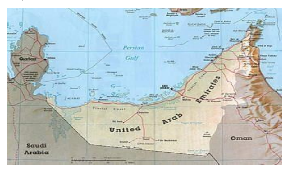
FIGURE 1 THE MAP OF UNITED ARAB EMIRATES (UAE)

The UAE lies in the southeast of the Arabian Peninsula. Its borders to the north and North West are with the Arabian Gulf and Gulf of Oman. In the south, it borders Oman; in the southwest and west Saudi Arabia; and in the west Qatar, Figure: 3.1 show the map of United Arab Emirates (UAE). The U.A.E 's location makes for easy communication and significance as a world transit area for commerce between East and West (Dana, Palalic & Ramadani, 2021).