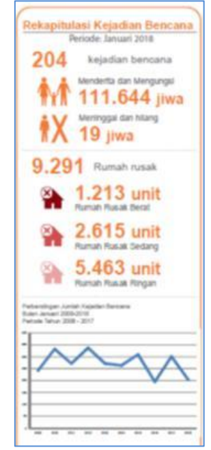
FIGURE 1 RECAPITULATION OF DISASTER DATA FOR 2018

Indonesia itself since 2001 has had a set of regulations related to disaster management, such as Presidential Regulation No. 3 of 2001 concerning the National Coordinating Agency for Disaster Management and Refugee Management as amended by Presidential Decree No. 111 of 2001. In 2005 this policy was enhanced through the replacement of the Presidential Decree with Government Regulation (PP) no. 85 of 2005 concerning the Disaster Management Coordination Agency. However, the two regulations have not been able to become an umbrella that provides legal certainty. In addition, this regulation only focuses on establishing an agency to carry out emergency response tasks, meaning that it focuses on the aftermath of a disaster and there is no countermeasures aspect. The high incidence of disasters that have occurred during a period of 2 (two) years in Indonesia makes it necessary to pay more attention to disaster management in Indonesia.