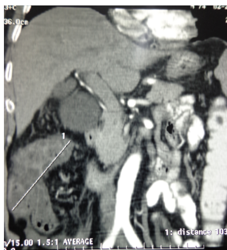
Figure 2. Abdominal CT scan with three-dimensional reconstruction showing tumoral obstruction of the right colonic with infiltration of mesenteric fat.

Usually, this form of CD seems to be minimally aggressive and respond well to medical therapy. Indeed, Maamouri et al. had mentioned in their case a clinical remission after a local treatment with one gram per day of aminosalicylates [13]. Mnif et al. had also described a lesions regression after two months of systemic corticosteroids [14].