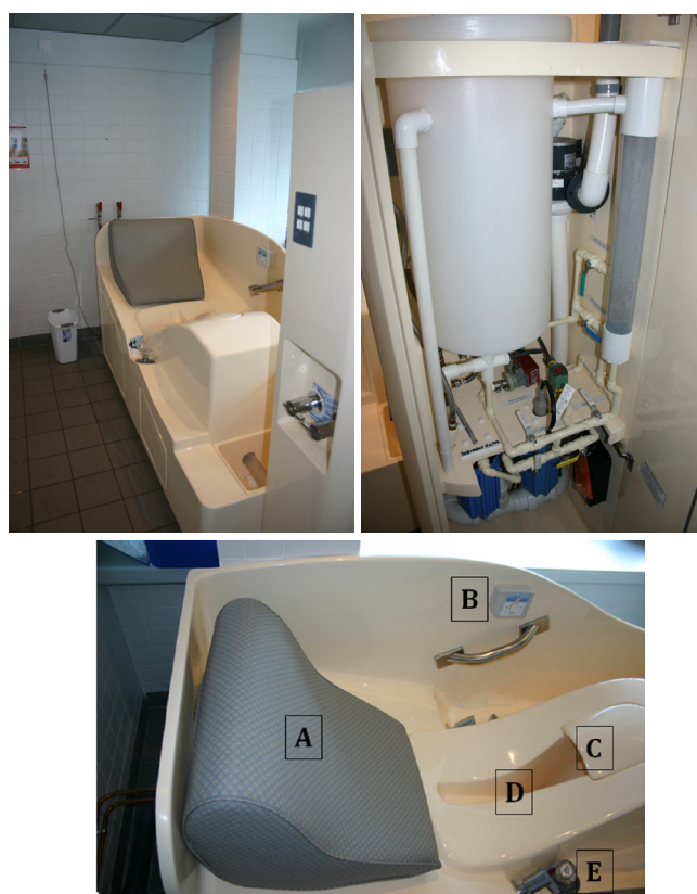
Figure 1: General view of the Angel of Water device used in the study (upper left panel). Inside view showing the water tank, the water circuitry and the filters (upper right panel). Patient seat (A) with an emergency switcher (B), the connection for the rectal cannula (C), the evacuation output (D) and the tap controlling the mixing supply of hot and cold water to the tank (E).

Patients with an indication of colonoscopy aged 18-80 years were included. Exclusion criteria were: history of colonic surgery, abdominal hernia, clinical suspicion of bowel obstruction or colonic stenosis, acute flare of inflammatory bowel disease, pregnancy, uncontrolled heart disease or renal insufficiency, weight >182 kg, known allergy or hypersensitivity to PEG. The study protocol was approved by the Regional Ethics Committee. Written informed consent was obtained from all patients. The trial was registered on Clinicaltrials.gov under NCT 01871584. The device for water infusion Angel of Water® (Lifestream, Austin, TX – FDA clearance K003720, June 27, 2002; CE-Mark 504677, May 22, 2006) is constituted of a 35L water tank maintained at 37°C by a heating system ( Figure 1 ). Water is filtered through ionic and ultraviolet filters and infused by gravity through a single-use cannula, into the rectum ( Figure 2 ) in 20-30 minutes. The patient sits on an adapted seat allowing easy passing of water and evacuation of feces, in a semi-reclined position. At the end of the procedure, the patient is asked to evacuate the remaining colonic content in the toilet,