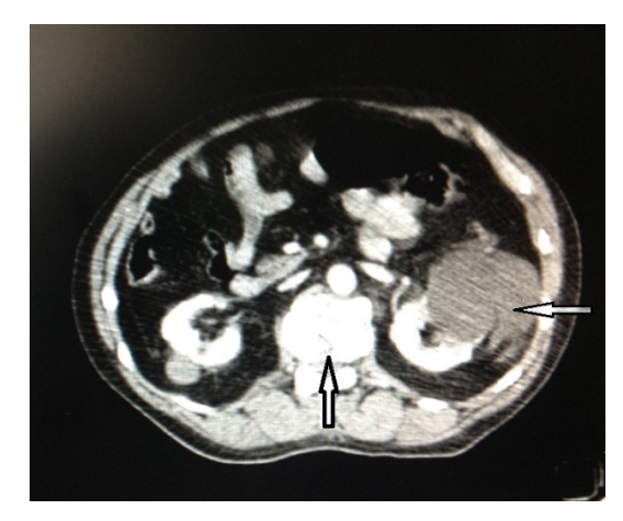
Figure 1. Spleen hematome associated with lumber spinal fracture.

had moderate injuries (ISS=10-15), 28 (10.7%) had severe injuries (ISS=16-25), and 22 (8.9%) had profound injuries (ISS>25). The correlation between ISS and duration of hospital stay was positive and statistically significant (rs=0.382, p<0.01). The duration of hospital stay was prolonged as ISS increased.