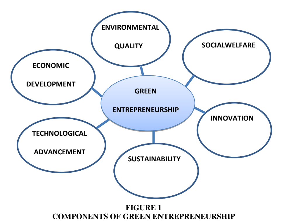
The concept of the green entrepreneur

Green entrepreneurship has many aspects based on two main dimensions: green product and green processes. It was illustrated by Stuti & HaldarIndira in the following figure: