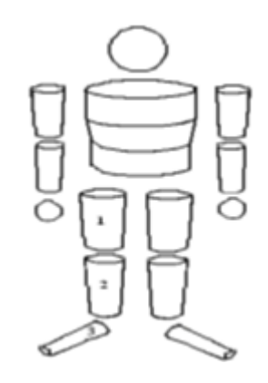
Figure 3. Modified hanavan model.

Table 1. Demographic data of the participants.