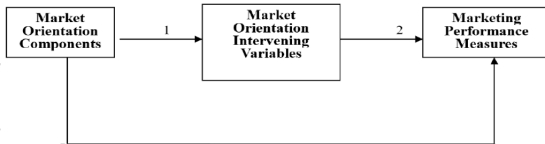
Figure 1 FRAMEWORK ON MARKET ORIENTATION