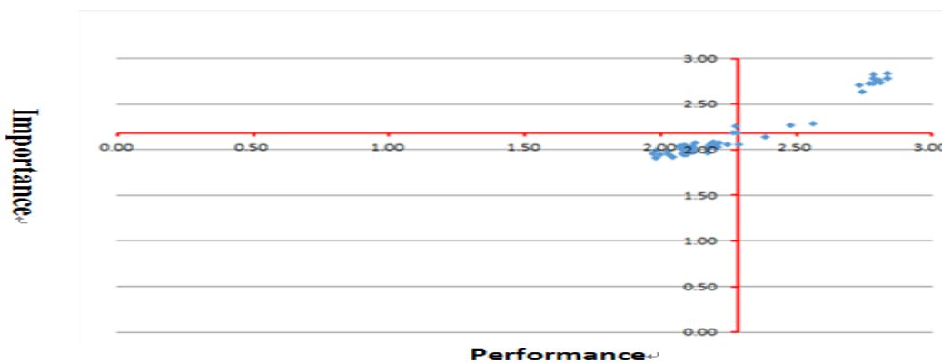
FIGURE 3 ATTRIBUTES POSITIONING IN THE IPA QUADRANT