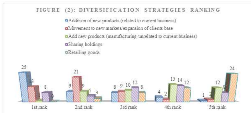
FIGURE 2 DIVERSIFICATION STRATEGIES RANKING