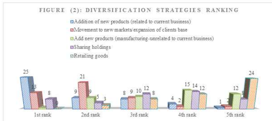
FIGURE 2 DIVERSIFICATION STRATEGIES RANKING