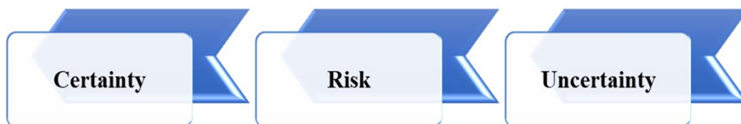
FIGURE 1 DECISION ENVIRONMENT

Decision theory is mainly related to decision making in conditions of risk and uncertainty. If we imagine a scale to represent the measure of uncertainty of a decision, it would have two edges where one would indicate certainty conditions while the other would indicate complete uncertainty conditions. The risk would take an intermediate place (Figure 1).