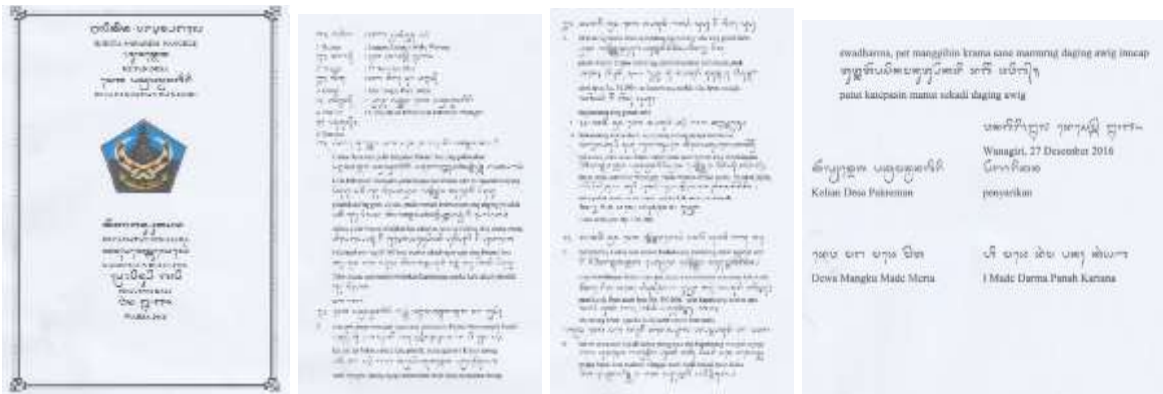
FIGURE 2 EXCERPT OF AWIG-AWIG (CUSTOMARY LAW) WANAGIRI CUSTOMARY VILLAGE ON FOREST

The initial assumption is that if we refer to the issuance of the permit, the orientation of the Village Forest Policy (HPHD) in Wanagiri Village is only rigidly oriented towards the Official Village without any orientation influence on the Wanagiri Indigenous Village. Therefore this research discusses more deeply about the orientation that is aimed at the current Village Forest policy as well as the policy orientation needed by HPHD in the future so that it can be synergized with local wisdom and support forest conservation in a sustainable manner (Soekanto, 1979).