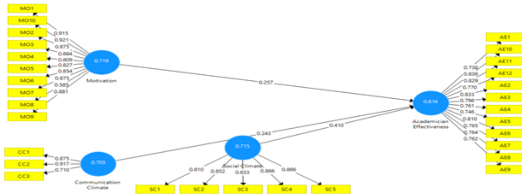
FIGURE 2 MEASUREMENT MODEL