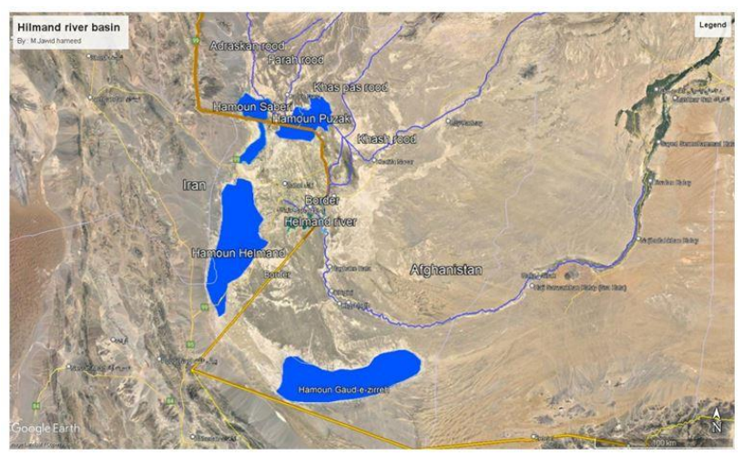
FIGURE 3 HILMAND RIVER BASIN

The primary resource of all Hamouns is the Helmand River, and Khash Road, Farah Road Adraskan Sub Rivers and some other recharge of Hamouns are drainage can as of irrigation located in Iran side shown in the (Figure 3) below.