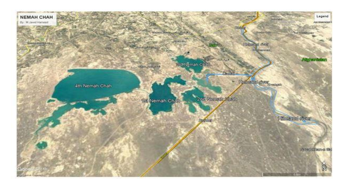
FIGURE 4 CANALS &NEMAH CHAH

In the Hamouns, the main factor is that Iran creates many problems for the residents. Resulting in unfair acts of help with shortages of water levels. So ultimately, the Hamouns become dry up, the requirement of water increases to irrigate the plants, soil humidity is decreasing, deserts, sand hurricanes are increasing all these factors has caused to destruction the animal habitats.