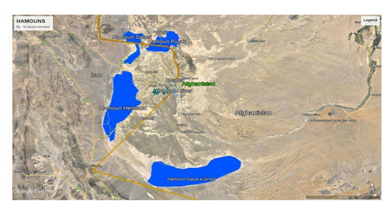
FIGURE 2 HAMOUNS WETLANDS

The total area of these Hamouns is 7421.2 \text{ km}^2 the capacity is around 36.7972 \text{ billion } m^3 Gaud-e-Zirreh is one of the most significant lakes of these region depths is around 10meter, and the