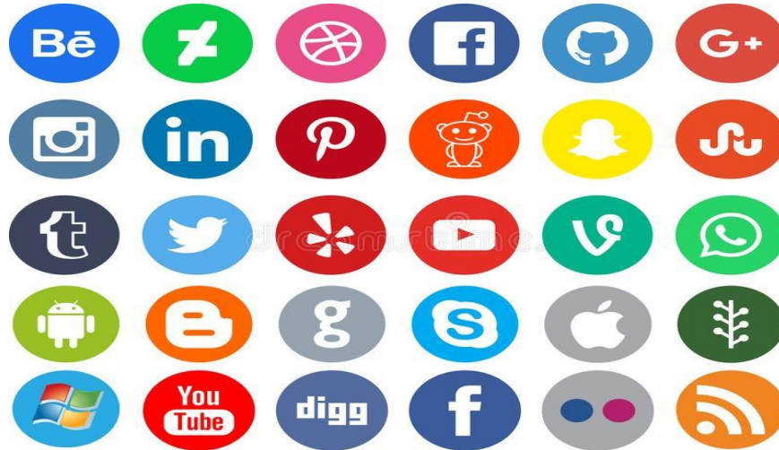
FIGURE 1 SOME SOCIAL LOGO

In most e-business businesses, performance is ascribed to the volume of traffic that a company gets from customer requests on per second, minute, hour and per day. By traffic, it means the number of customer requests for the product of such a company. Likewise, since higher sales are tantamount to more income, it appears that a break-even point may equally occur for any business.