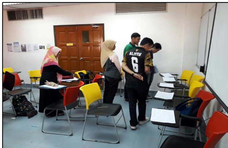
Figure 7 shows one of the groups' sample diagram of simplified topic matter - "Firms and Perfect Competition Market" using the mind-mapping method.