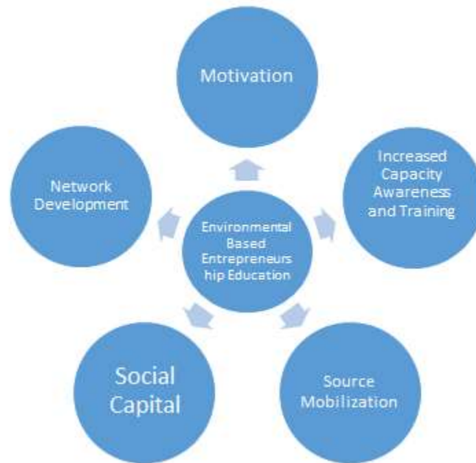
FIGURE 2 AN ENVIRONMENT-BASED ENTREPRENEURSHIP EDUCATION MODEL IN THE VILLAGE OF MARGALAKSANA CIPEUNDEY, INDONESIA

ins and outs of entrepreneurship (Figure 2 (Source: (Sumodiningrat, 2009) modification by the author)).