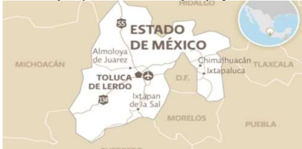
FIGURE 1 HUEHUETOCA, STATE OF MEXICO

deprivation, 8.1 is vulnerable in terms of income, 21.4 is neither poor nor vulnerable, 30.7 is located in the moderate poverty line and 5.7 in extreme poverty Figure 1.