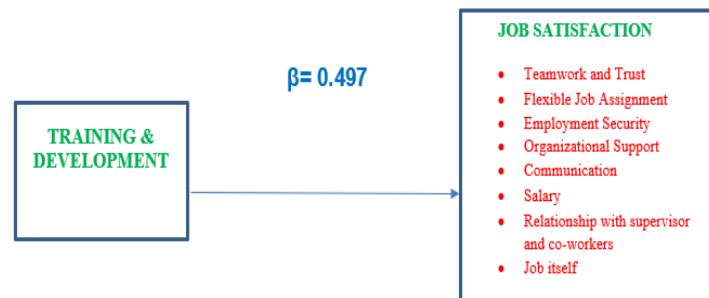
Figure 3 CONCEPTUAL MODEL