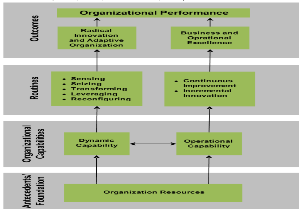
Figure 1 DYNAMIC CAPABILITIES V/S OPERATIONAL CAPABILITIES