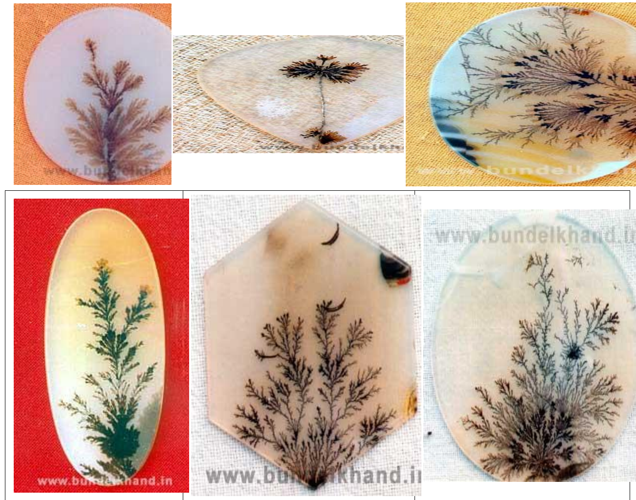
FIGURE 1 NATURAL SHAJAR STOEN OF BANDA

Sources figure has been taken from district udhyog sSanghbanada is called as dendrite agtite. Plane (Agate).