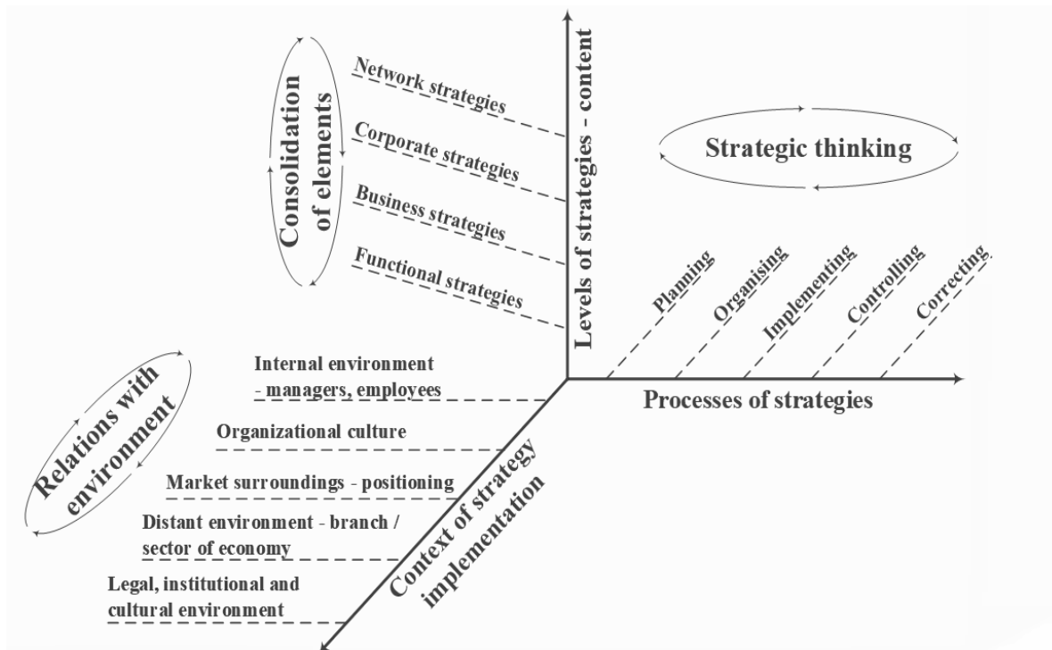
FIGURE 2 FRAMEWORK OF STRATEGIES

The quantitative stage of evaluation began with the area of defining strategy and components, which determined the space for discussion. In the individual proposals of definitions and concepts, different components of a strategy are emphasised. An organisation's strategy is a combination of the components specified in these various concepts and definitions (Figure 2).