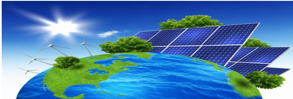
FIGURE 2 RENEWABLE ENERGY SOURCES