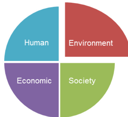
FIGURE 1 PILLARS OF SUSTAINABILITY (ASRA, 2021:7)