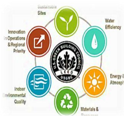
FIGURE 3 THE LEED SCHEME (IBRAHIM ET AL., 2010:13).