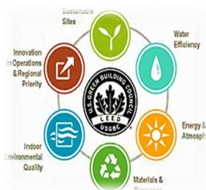
FIGURE 3 THE LEED SCHEME (IBRAHIM ET AL., 2010:13).